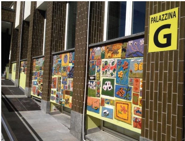
Dream Carpet - Entrance to Building G