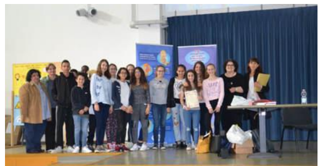
Project Electrosmog with Borgomanero's Schools and Municipality