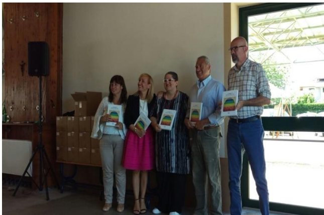
Presentation of the book "Saturdays of health"