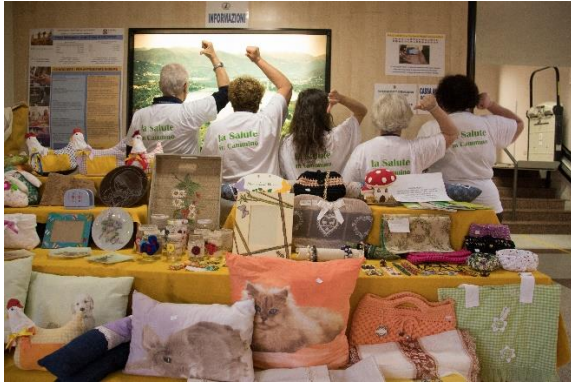
End-of-year show on the Association's tenth anniversary