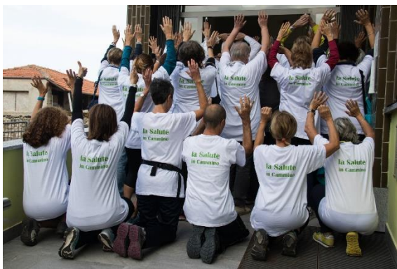
Fitwalking Course Group