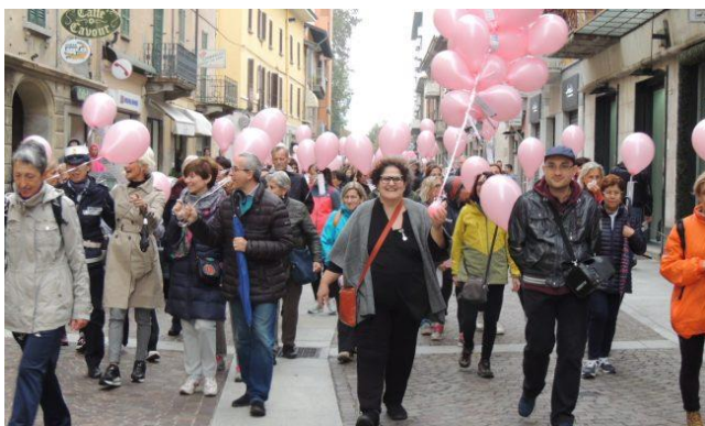
October in Pink 2018: the Walk of Health