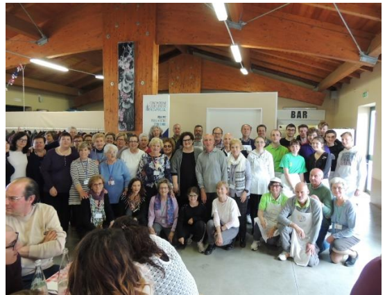
Lunch on the occasion of the National Cancer Patient Day – 2018