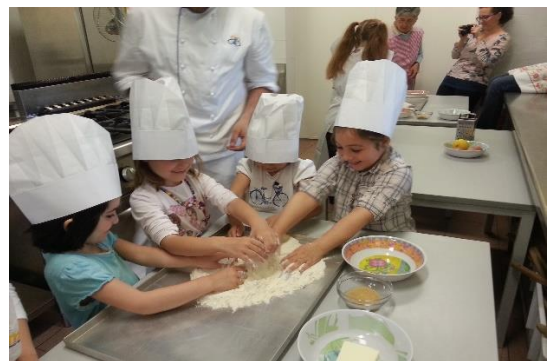
Cooking courses with children from San Maurizio D'Opaglio