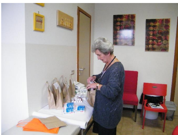
Preparation of drug kits