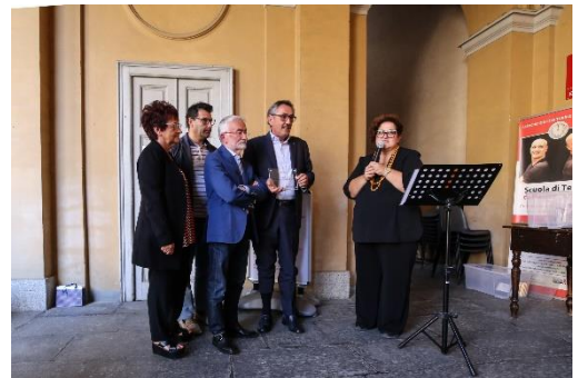
Award ceremony Lion Club Borgomanero HOST