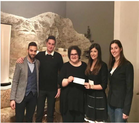
Evening with Rotaract Borgomanero-