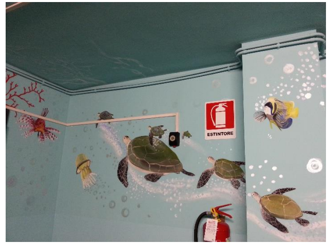
Entrance to Oncology Complex Structure