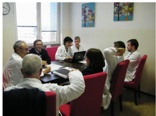
Meeting room for GIC (Interdisciplinary Groups and