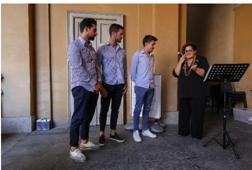
Award ceremony Leo Club Borgomanero