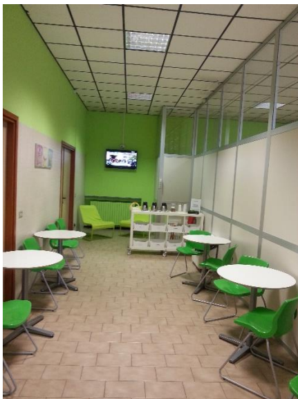
Refreshment Point - Christmas Breakfast